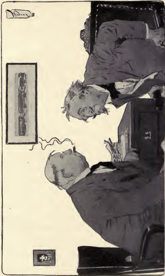
“ ‘ I will tell you what it is,’ said Mr. Gratz”